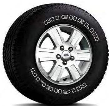
16" Painted Cast Aluminum Wheel – 64P (Std. XLT)