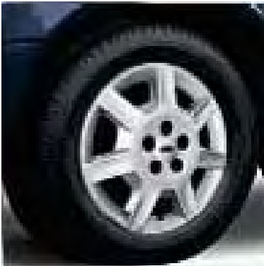
16" Steel Wheel with Deluxe Wheel Cover Std. on SE