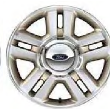
18" Bright Aluminum Wheel (Std. Lariat) – 64M