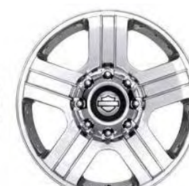
20" Polished Forged Aluminum (Ford Harley-Davidson™ SRW)