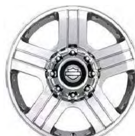
20" Polished Forged Aluminum (Ford Harley-Davidson™)