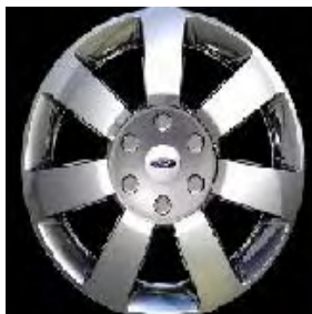
18" Chrome Clad Aluminum Wheel (Std. on Limited (Non-EL & EL)) – 64L