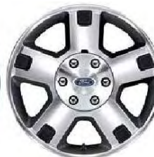
18" Machined Cast Aluminum Wheel (Std. FX4) – 64L