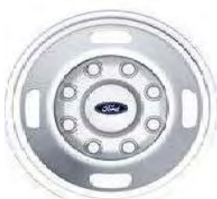
17" Steel (Std. XL, XLT, DRW) (643)