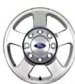
17" Premium Forged Polished Aluminum (Lariat) (Standard) (64D)