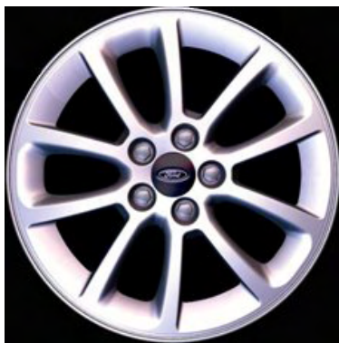
18" Painted Aluminum Wheels Optional on SEL/SEL "PLUS" (64R)