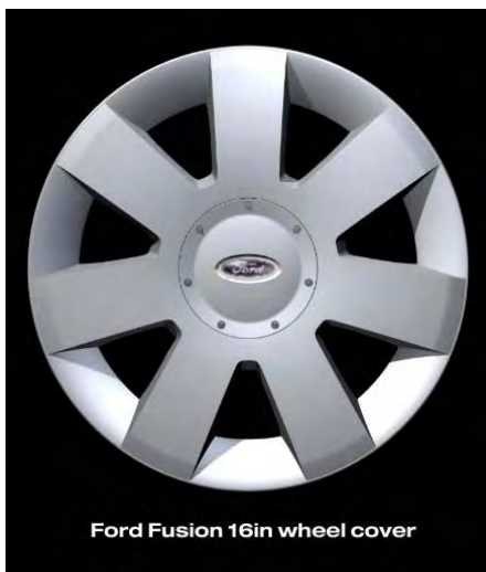
Ford Fusion 16in wheel cover

16" Steel Wheel w/Deluxe Wheel Cover Standard on S