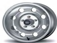
15" Forged "Bright Polished" Aluminum (4x4 FX4/Level II, FX4/Off-Road) (645)