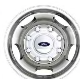
17" Forged Polished Aluminum (Lariat, DRW) (64K)