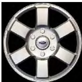
17" Aluminum Wheel (Std. XLT (Non-EL/EL & SSV EL)) – 64I