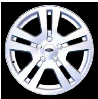
17" Painted Aluminum Wheels Standard on SE and SEL/SEL "PLUS" (64F)