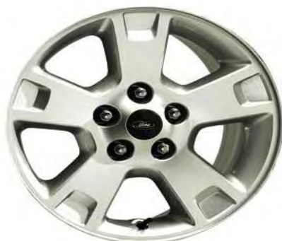
16" Aluminum Wheel (Std. XLT) – 64S