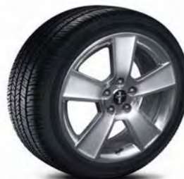
18" Premium Aluminum Wheel Opt. on GT (64E)