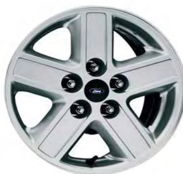
15" Aluminum Wheel (Opt. XLS Manual & XLS) – 645