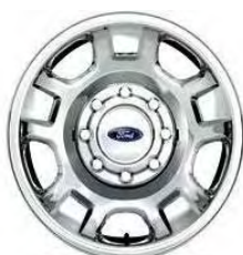
18" Chromed Steel w/Bright Center Ornament (Std XLT SRW) (64E)