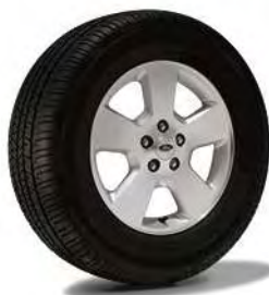
16" Aluminum Painted Sport 5-Spoke Wheel Std. w/65A SE Appearance Pkg.