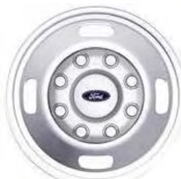
17" Argent Steel (XL & XLT, DRW) (Standard) (643)