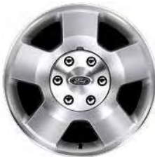
17" Machined Aluminum (Opt. STX) – 64Y