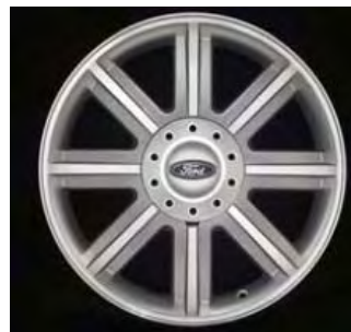
18" 8-Spoke Aluminum Wheel w/Bright Finish Std. on LIMITED (64E)