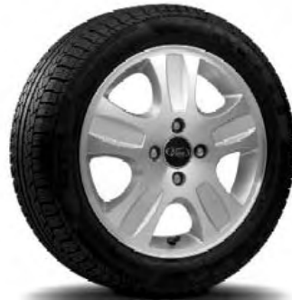
16" 5-Spoke Machined Alloy Wheel w/Argent Pockets Std. on ST (64Y)