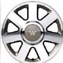
18" 7-Spoke Aluminum w/King Ranch Paint (King Ranch Pkg) – 64R