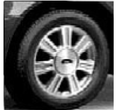
16" 7-Spoke Machined Aluminum Wheel Std. on SEL