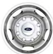
17" Forged Polished Aluminum (Std. Lariat DRW, Opt XLT DRW) (64K)