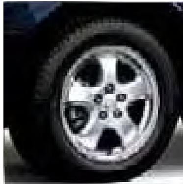
16" 5-Spoke Painted Aluminum Wheel Opt. on SE (64M)