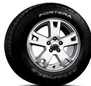
17" Painted Cast Aluminum Wheel – 64H (Avail. w/XLT Appearance Pkg. – 66T & Fleet Vehicles only)