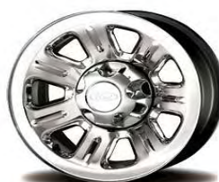
15" 7-Spoke Chrome Clad Steel (XLT/SPORT 4x4 R/C) (64G), (XLT 4x2 Appear. Pkg. (91A))