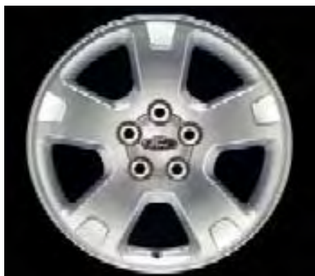
17" 5-Spoke Bright Aluminum Wheels Std. on SEL (64B)