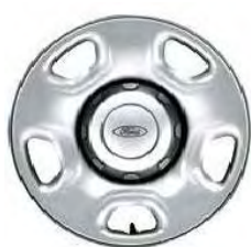
17" Grey Styled Steel (Std. XL) – 64C