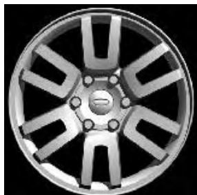
18" Machined Aluminum Wheel (Opt on XLT (Non-EL & EL) & Eddie Bauer (Non-EL only); Std on EL Eddie Bauer) – 64K