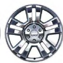
22" Polished Forged Aluminum Wheel with Painted Accents (Harley-Davidson™ Pkg) – 64H