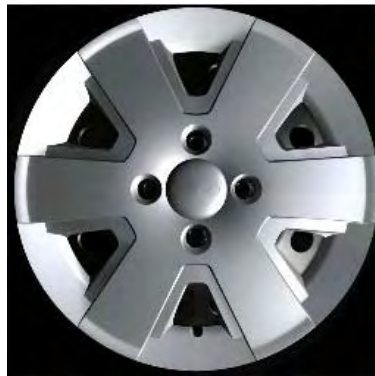
15" 6-Spoke Steel Wheel Cover Std. on SE (646)