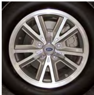
16" Painted Aluminum Wheel w/Bright Machined Face w/Chrome Spinner Std. on V6 Premium & Opt. on V6 Deluxe (941)