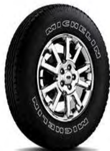
18" Machined Aluminum Wheel – 64T (Std. Limited)