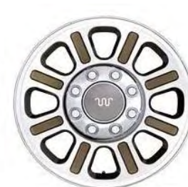
18" Painted Aluminum (Standard) (King Ranch)