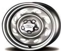
15" Argent Painted Steel (XL 4x2) (643)