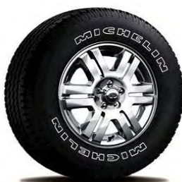
18" Chrome-Clad Aluminum Wheel (Opt. Eddie Bauer and Limited) (649)