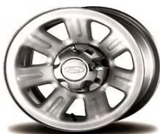
15" 7-Spoke Silver Painted Steel (SPORT and XLT 4x2, XL 4x4, Opt. XL 4x2) (64E)