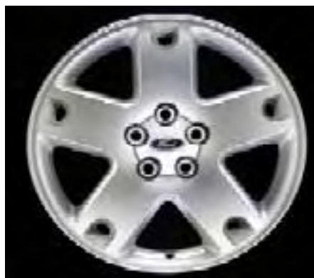
18" Bright Aluminum Wheels Std. on Limited (64C)

* = The final drive ratios are dictated by the WOT 0-60 mph performance objectives, which are driven by vehicle weight. While the FDR seems high, because the transmission is a CVT, the effective drive ratio will always be the lowest at any road load operation condition. The effective drive ratio under road load conditions, at any given vehicle speed, will be lower than typical 4 and 5-Speed Step Ratio Transmissions, hence the engine speed will be lower for the CVT transmission.