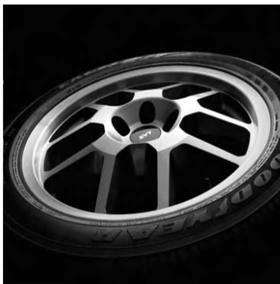
18"x9.5" Bright Machined Aluminum Wheels Standard on GT500 Coupe & Convertible