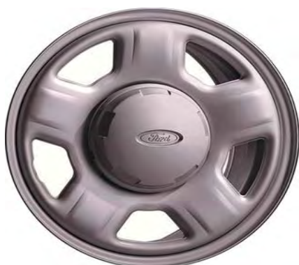
15" Styled Steel Wheel (Std. XLS Manual & XLS) – 643