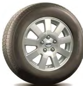
16" Nine Spoke Aluminum Wheel Std. on LX