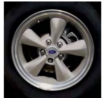
17" Premium Painted Cast Aluminum Wheel Std. on GT Deluxe & Premium (64F)