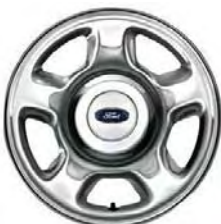
17" Chrome Clad Steel (Std. STX & XLT) – 64E