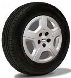
16" Steel Wheel with 5-Spoke Styled Wheel Cover Standard on Freestar Cargo Van