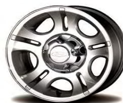
15" Machined "Split Spoke" Cast Aluminum (STX Series, XLT Appear. Pkg. Opt. 2) (64H)