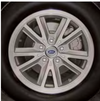
16" Painted Aluminum Wheel w/Bright Machined Face Std. on V6 Deluxe (94B)