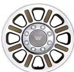
18" Painted Aluminum (Standard on King Ranch)