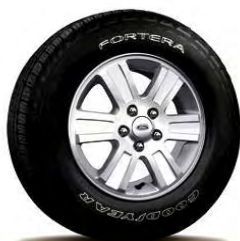
16" Painted Aluminum Wheel (Std. XLT) (64E)