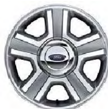
17" Machined Aluminum Wheel w/ Painted Accents (Opt. XLT) – 64F