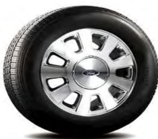
16" Chrome Plated Wheel Optional on LX