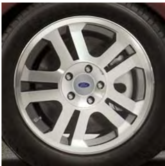
17" Bright Machined Cast Aluminum Wheel w/Large Tri-bar Pony Center Cap Opt. on GT Deluxe & Premium & V6 Premium (64D)