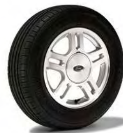
16" Bright Machined 5-Spoke Wheel Std. on SEL, Opt. on SE (w/FIN code)