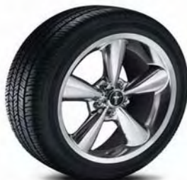
18" Polished Aluminum Wheel w/Small Tri-bar Pony Center Cap Opt. on GT (64W) Included in Cal Special Package (54 C)