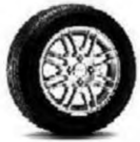
15" Multi-Spoke Alloy Wheel Std. on SES Wagon; Opt. on S and SE (64L) Included in SE Sport Group (67S)