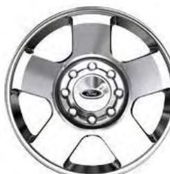
20" Polished Forged Aluminum★ (Lariat, King Ranch) (Optional) (64T)