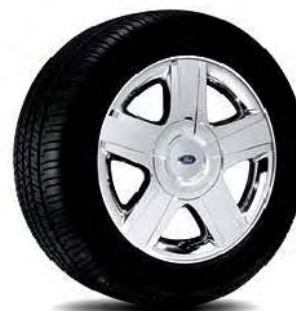
16" Chrome Clad Wheel Std. on Limited