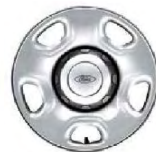
17" 7-Lug Steel Wheel (Heavy Duty Payload Pkg) – 64K

1-Regular Cab only, 2-SuperCab only, 3-SuperCrew only ★ = New for this model year.