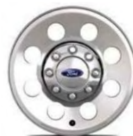
17" Forged Polished Aluminum (XL/XLT) (Optional)(64B)