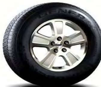
17" 5-Spoke Aluminum Wheel Optional on LX ordered with option 41K