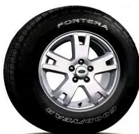
17" Machined Aluminum Wheel ( Included with XLT Appearance Package) (64X)