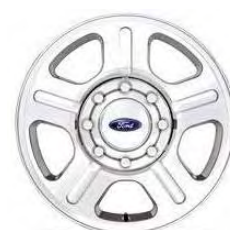
18" Premium Polished Aluminum w/Bright Center Ornament (Std Lariat SRW) (64G)