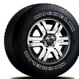
Ironman Wheel 18" Machined Aluminum Wheel (Included with Ironman Package) (64K)