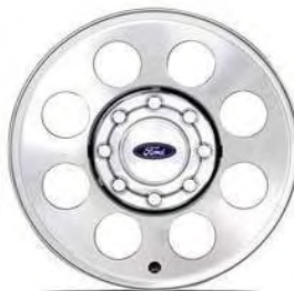
18" Forged Polished Aluminum (XLT, SRW) (Optional) (64F)