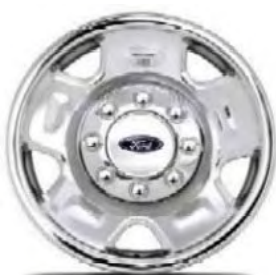
17" Chromed Steel (XLT) (Standard) (64A)