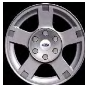
17" Machined Aluminum Wheel (Std. Eddie Bauer (Non-EL)) – 64J