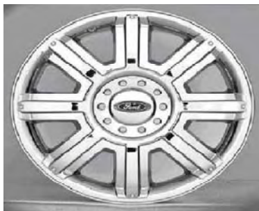
Chrome Clad 18" 8-spoke Aluminum Wheel, Optional on SEL and Limited (64H)