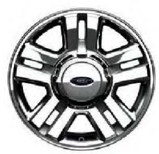
18" Chrome Clad Aluminum (Std. XLT & Lariat Chrome Pkg) – 64T