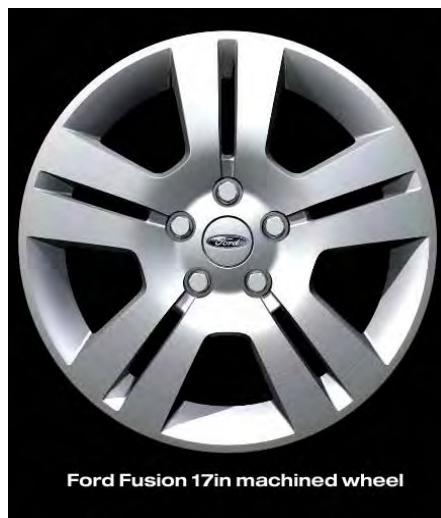
Ford Fusion 17in machined wheel