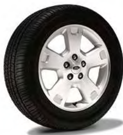
17" Polished Alloy Wheel Opt. on Limited (64V)