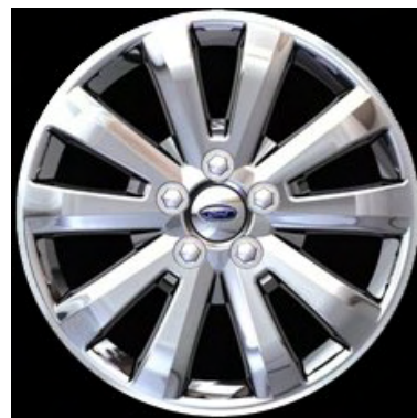
18" Premium Aluminum Chrome- clad Wheels Optional on SEL/SEL "PLUS" (64G)

* = The final drive ratios are dictated by the WOT 0-60 mph performance objectives, which are driven by vehicle weight. While the FDR seems high, because the transmission is a CVT, the effective drive ratio will always be the lowest at any road load operation condition. The effective drive ratio under road load conditions, at any given vehicle speed, will be lower than typical 4 and 5-Speed Step Ratio Transmissions, hence the engine speed will be lower for the CVT transmission.