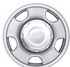
18" Steel w/Painted Hub Covers & Center Ornament (Std. XL SRW) (642)