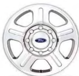
18" Premium Forged Polished Aluminum (Lariat) Optional (64G)