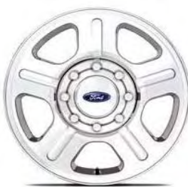
18" Premium Polished Aluminum (Lariat, SRW) (Standard) (64G)