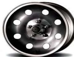
15" Forged Aluminum "Dark Shadow Grey" finish (4x4 FX4/Level II, Opt. FX4/Off-Road) (644)