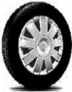
15" 9-Spoke Steel Wheel Cover Std. on S (64D)