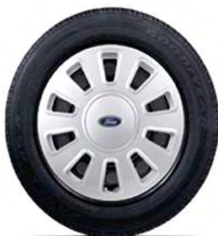
17" Styled Steel Wheel standard 750A & 770A, optional 720A & 730A