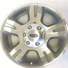
18" Aluminum Sport Wheel (Std. FX2 Sport Pkg) – 64S