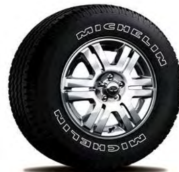
18" Chrome Clad Aluminum Wheel – 649 (Included with Limited Chrome Package (67A))