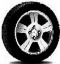
16" 5-Spoke Alloy Wheel Std. on SES – 3-Dr, Sedan, 5-Dr (64B)