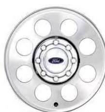
18" Forged Polished Aluminum w/Bright Center Ornament (Opt. XLT SRW) (64F)