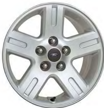
16" Aluminum Wheel (Std.)