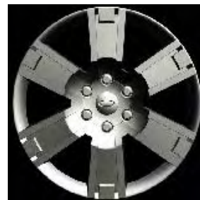
20" Chrome Clad Aluminum Wheel (Opt. Eddie Bauer & Limited (Non-EL & EL)) – 64M