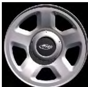
17" Steel Wheel (Std. – SSV (Non-EL)) – 64D