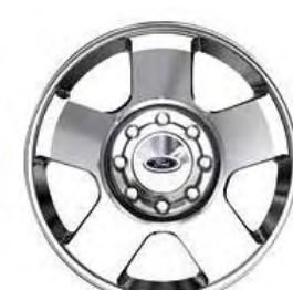
20" Polished Forged Aluminum