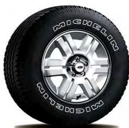
18" Machined Aluminum Wheel (Std. Limited) (648)