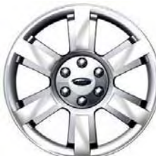
20" 6-Spoke Machined Aluminum Wheel (Opt. FX4, Lariat, FX2 Sport & King Ranch Pkg) – 64N