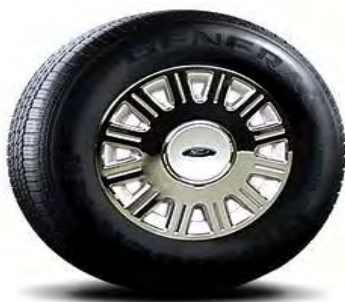
16" Steel Wheel Std. on Crown Victoria Standard