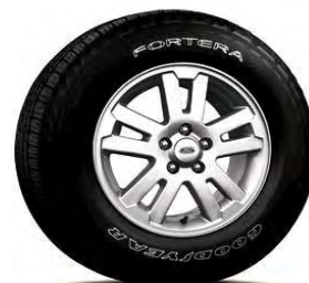
17" Painted Aluminum Wheel (Std. Eddie Bauer) (64H)