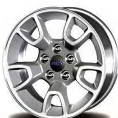
16" Y-Spoke Silver Painted-Inset Cast Aluminum (XLT, SPORT/TREMOR (4x4 S/C), FX4/Off-Road) (647)