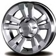
16" Twin-Spoke Silver Painted-Inset Cast Aluminum (TREMOR 4x2, option on SPORT 4x2 S/C) (646)