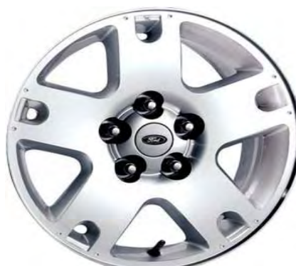
16" Bright Machined Aluminum Wheel (Std. XLT Sport & Limited; Opt. XLT 4WD Fleet) – 64E