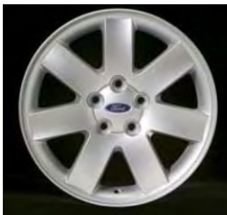
17" 7-Spoke Aluminum Wheel w/Exposed Lug Nuts Std. on SEL (64D)