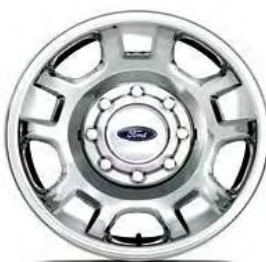
18" Chromed Steel (XLT, SRW) (Standard) (64E)