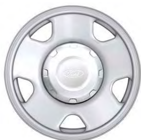
17" Argent Painted (XL) (Standard) (641)